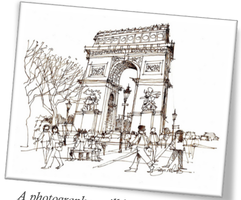
A photographer will be on hand to take Souvenir Photos of our guests in front of a Parisian street scene backdrop