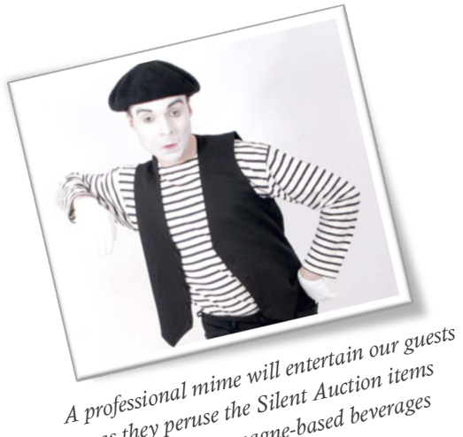
as they peruse the Silent Auction items and sip Champagne-based beverages

We think your business would benefit from supporting our organization and invite you to look at our very reasonable Sponsorship and Program Ad rates. Donations for our Silent Auction are also a great way to help us out!